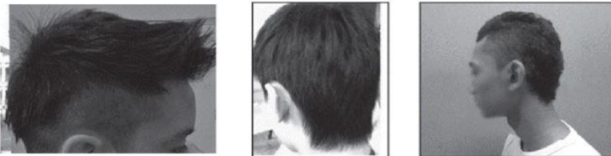
Sample of hairstyles not allowed in school include layered haircut and shaving only the sides (leaving the back portion longer).