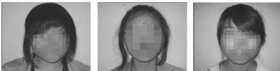
Sample of hairstyles (for girls) not allowed in the school. Fringes must be neatly clipped up (including those at the side of the forehead) - refer to page 17 for the standard hairstyle for girls.