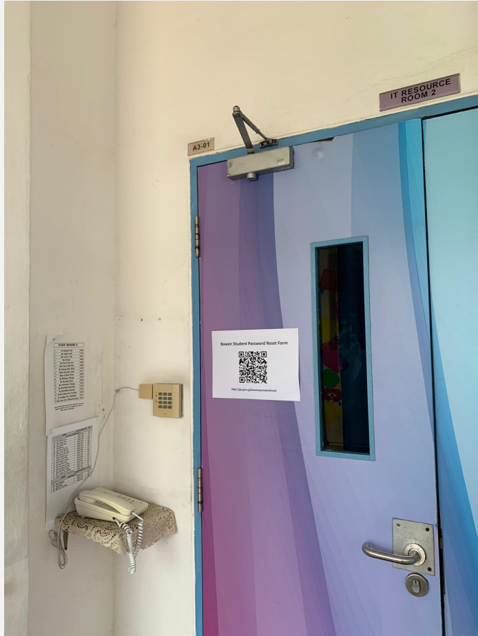
Staff Room 2