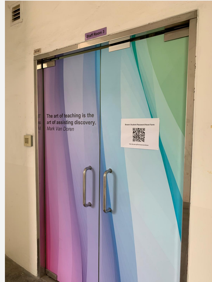
Staff Room 3