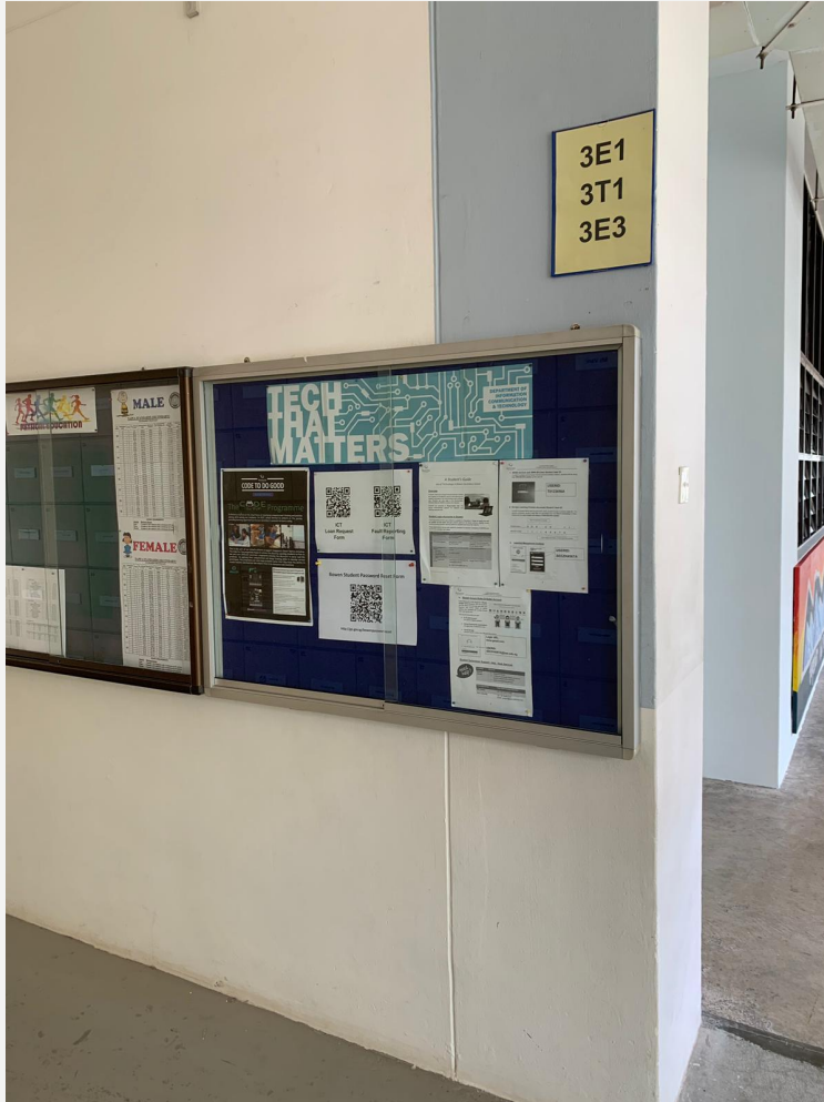
ICT Notice Board