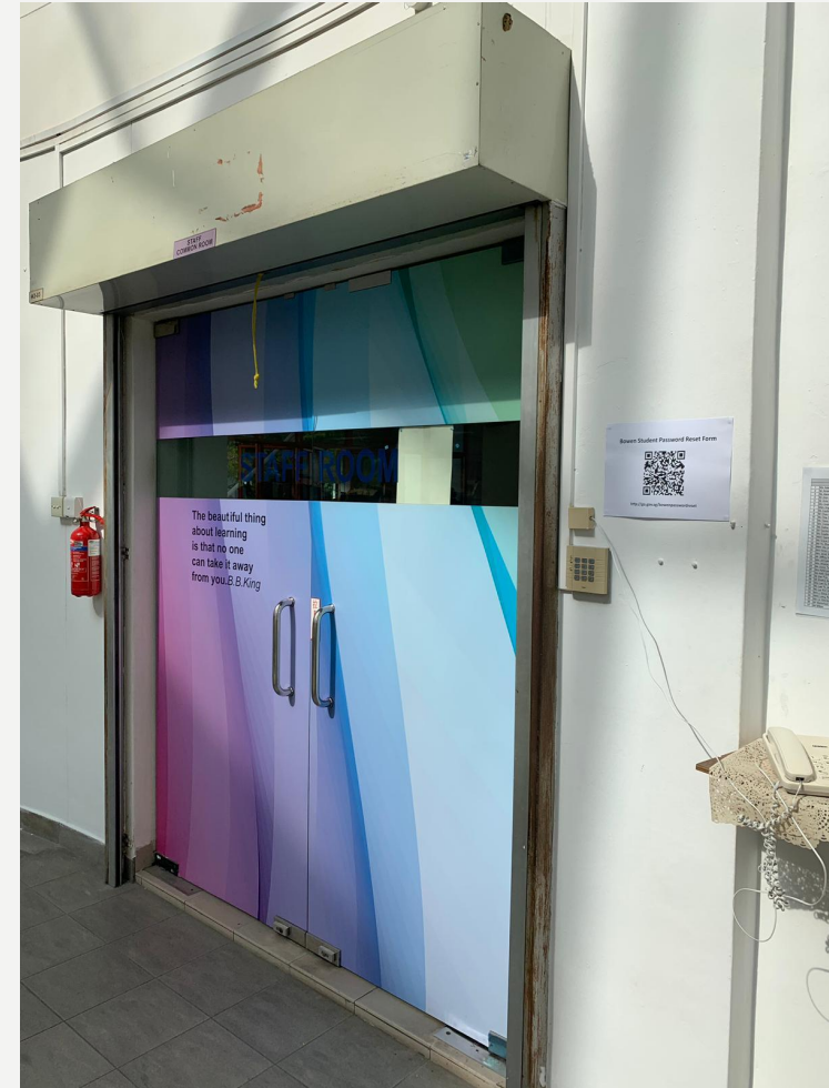
Staff Room I